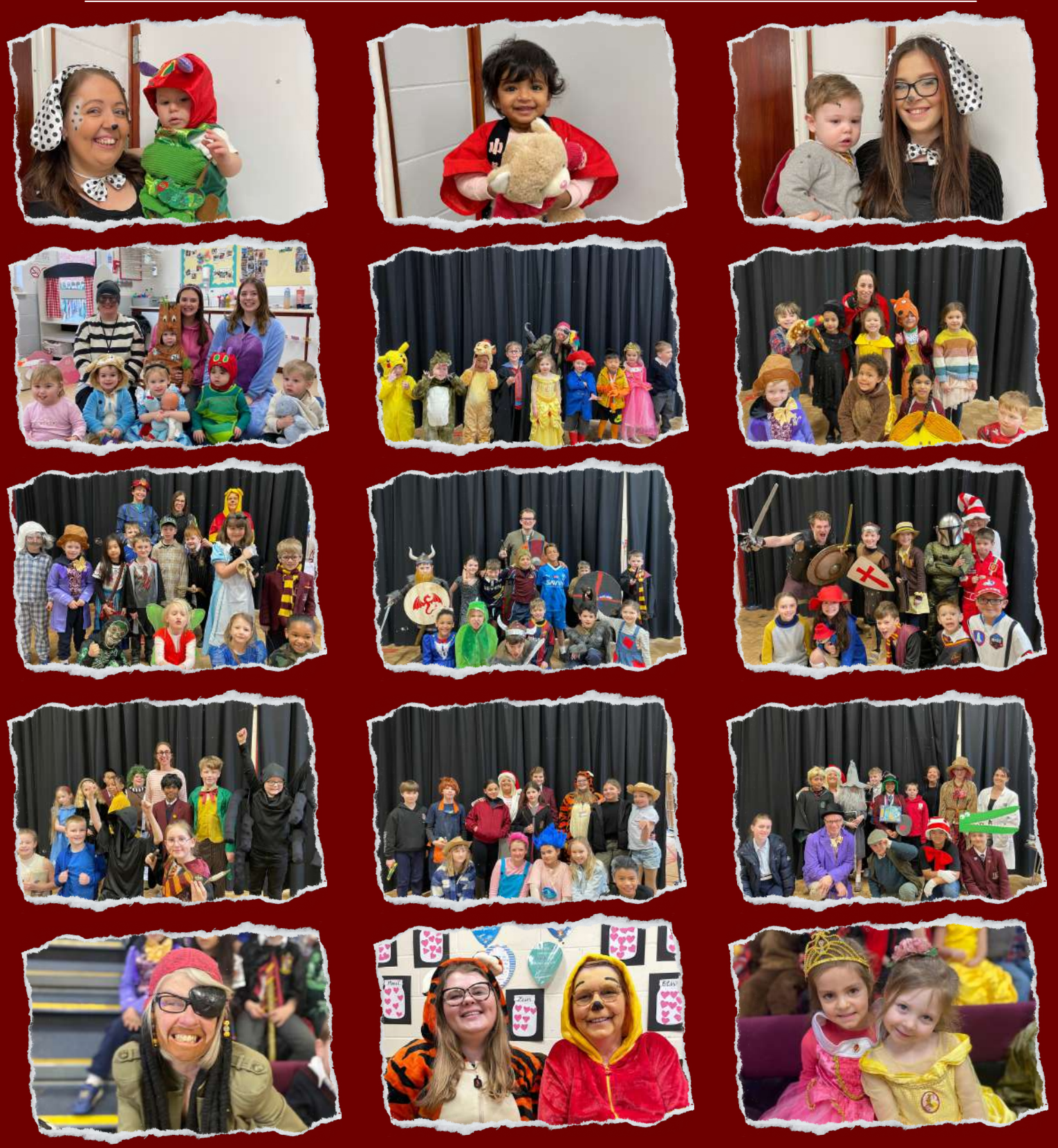
South Lee pupils and teachers truly outdid themselves with their incredible costumes for World Book Day! From classic literary characters to modern heroes, their creativity and enthusiasm were simply outstanding. It was a joy to see them embrace the magic of storytelling through their attire. ##WorldBookDay #SouthLeePrep