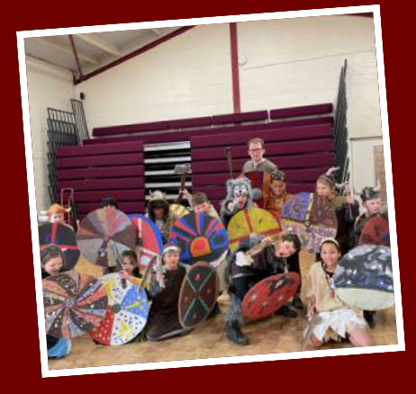
Our Year 3 pupils had a blast during Viking Day at school! From Viking helmets to Norse mythology, it was a day filled with excitement and learning. Here's to more fun-filled adventures ahead!