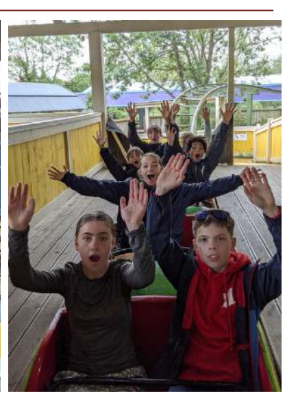
Laughter, adrenaline and a few nervous screams filled the air as Year 8 took on the twists, turns and towering drops of Pleasurewood Hills. A brilliant day of thrill-seeking and memory-making.