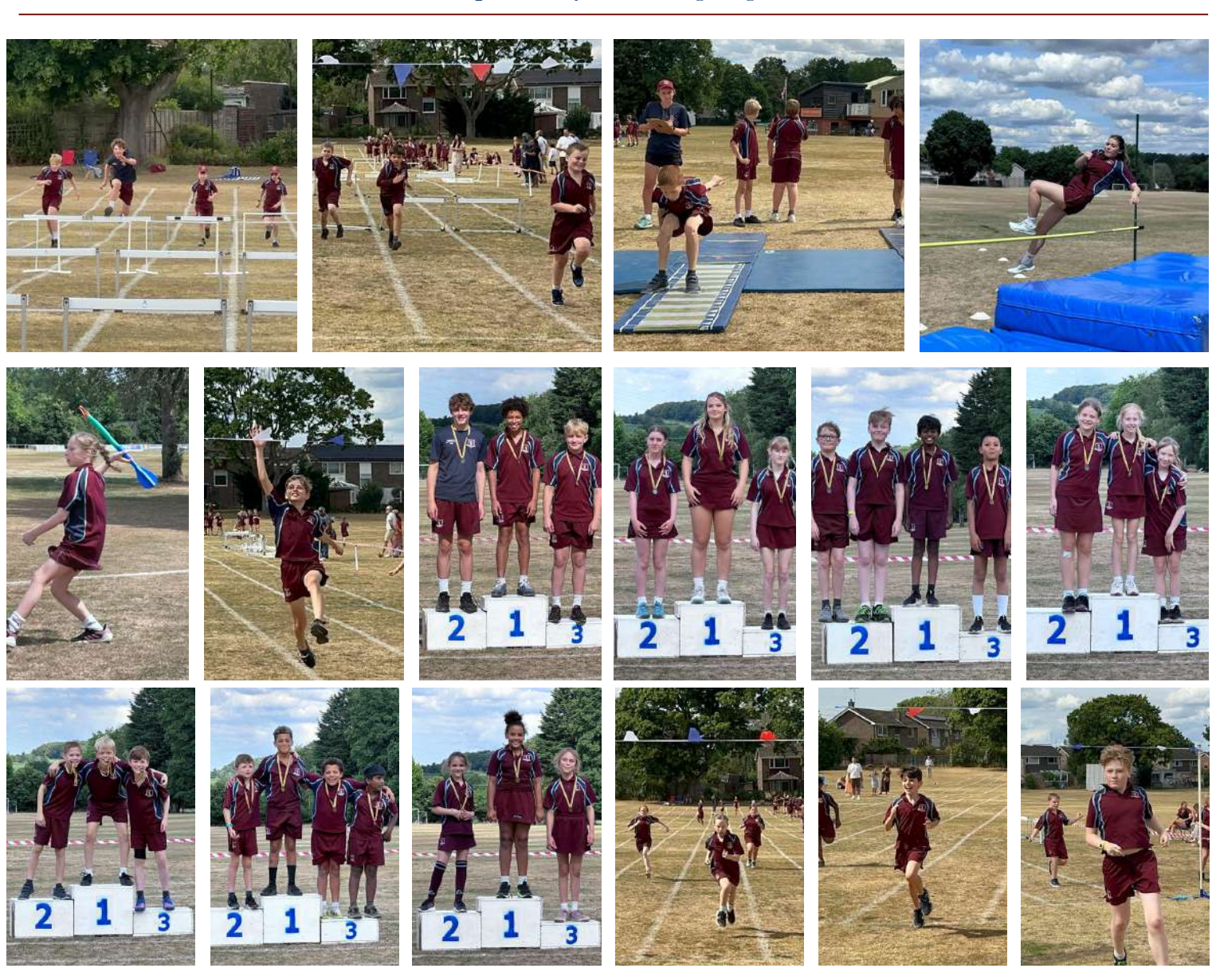
Sports Day for Years 4 to 8 was an action-packed event full of energy and excitement. Pupils raced, threw and jumped with determination, showing fantastic team spirit and enthusiasm throughout the afternoon. With house colours flying and plenty of cheers from the sidelines, every event was met with friendly competition and a real sense of camaraderie. From the sprint races to the relays, it was a day that showcased the true spirit of South Lee.