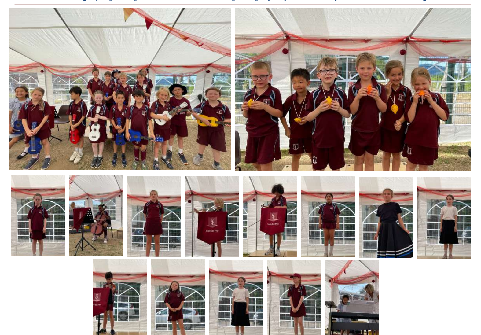
From thoughtful recitations to uplifting musical pieces, our Evening of Music & Verse showcased the range and depth of our pupils' abilities – with every performance earning warm applause from a proud audience.