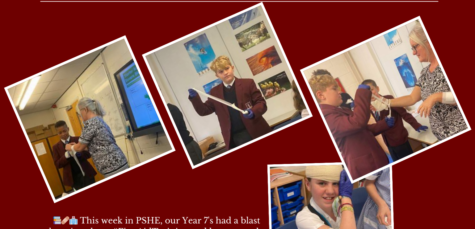
This week in PSHE, our Year 7's had a blast learning about #FirstAidTraining and how to apply bandages for any sudden mishaps! They were totally engrossed and found it super interesting! #LifeSkills #EducationMatters #HealthyHabits