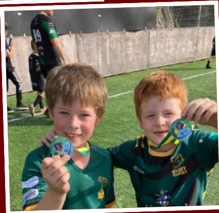
The recent Minis Rugby Festival was a phenomenal success! It was so heartwarming to see our children fully engaged, receiving medals we proudly sponsored! #TeamSpirit #YouthSports #CommunityPride #RugbyFun