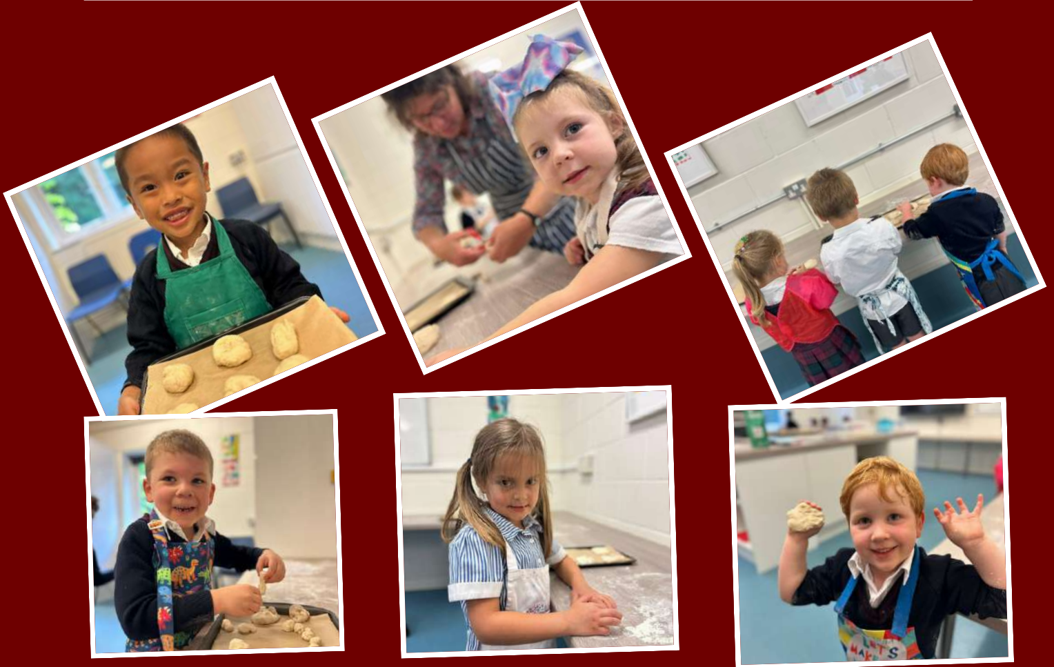
👩👧👦 Reception children had a blast learning to bake today! 🥰🍰 #BakingFun #LittleBakers #LearningThroughPlay