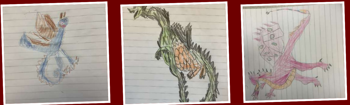
🐉🌟 Year 1 is getting creative with dragon designs! 🧠 We're diving into "How to Train Your Dragon" for inspiration and turning our ideas into fantastic poems! 📖📝 #DragonDesigns #InspiredByBooks #CreativeKids ❤️🇬🇧