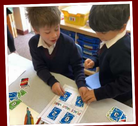
🇬🇧🇮🇪 Today in Year 2 Math class, we had a blast with Place Value Wars! 😊 We teamed up with partners and UNO cards to create 2, 3, or even 4-digit numbers. The highest number takes the victory! 🎯🎉 #MathFun #PlaceValueWars #LearningGames 🇬🇧🇮🇪