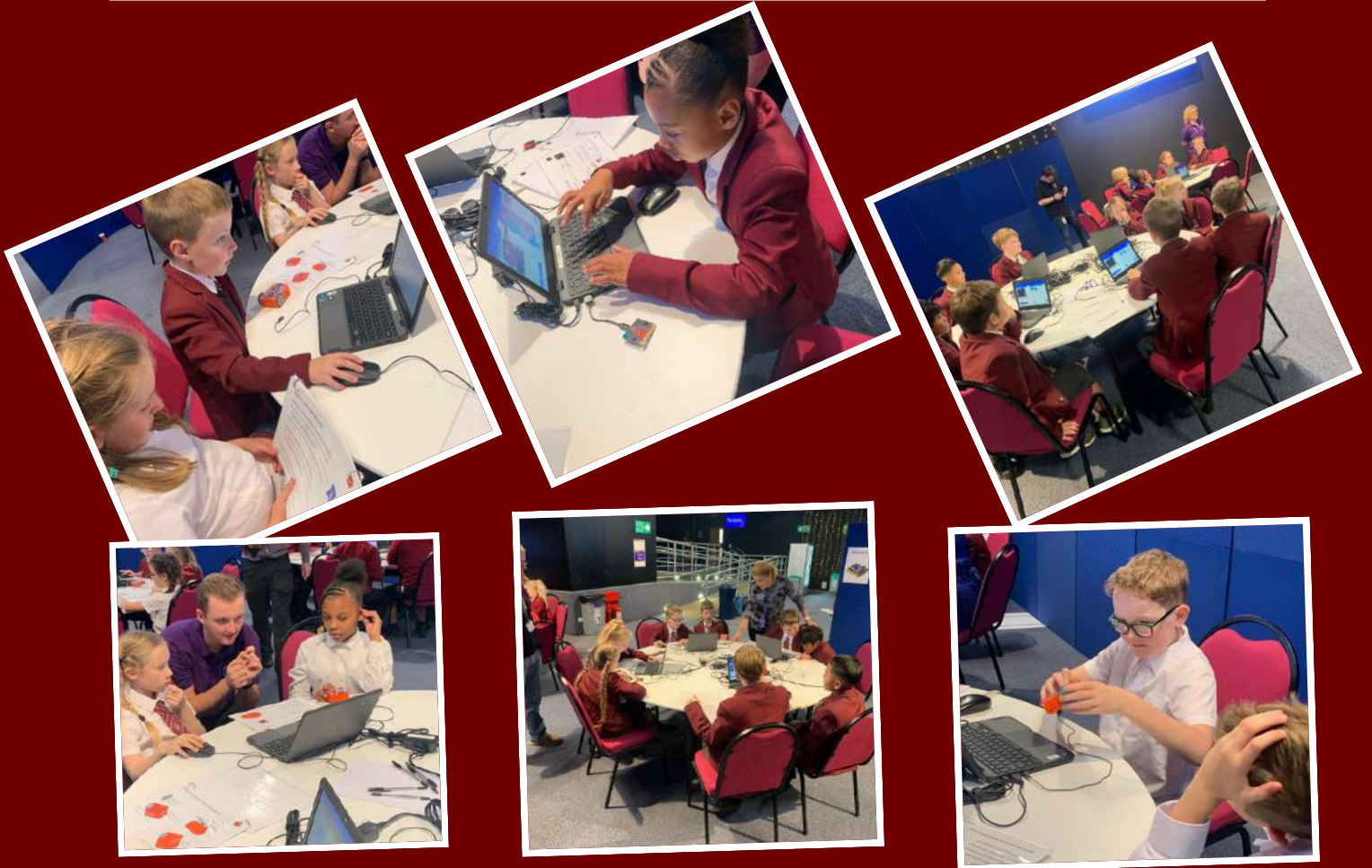
🌟 Our Year 5 pupils had an amazing day at Adastral Park for an Introduction to Physical Computing on October 3, 2023. 🤖 They were incredibly well-behaved and enthusiastic throughout the visit! 🙌👩🏫 #LearningAdventures #ProudTeachers #STEMEducation 🚀😊