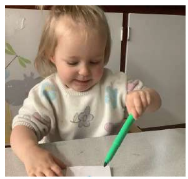
This week in Nursery, the children explored different tuff trays, including a Five Little Ducks tray filled with textures to feel and talk about, and a colourful sensory scarf tray to support curiosity and fine motor skills. We've also been busy colouring tiles for our display board — a lovely mark-making activity that encourages creativity and confidence.