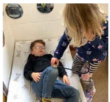
Our Pre-School children have loved exploring the theme People Who Help Us this week — especially getting into character during doctors' role play!