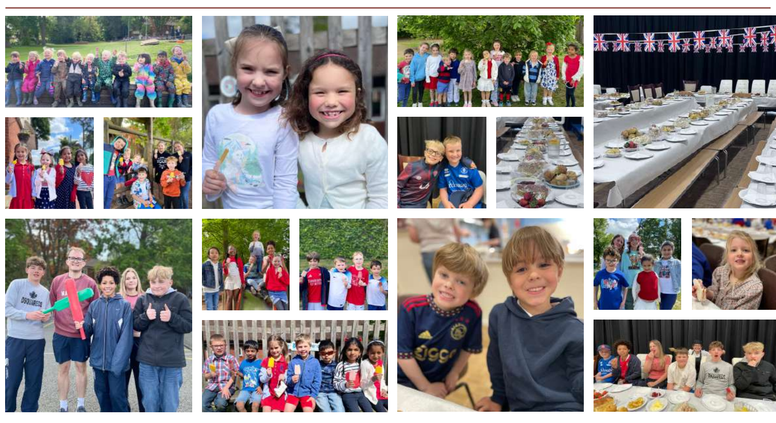
Our school marked VE Day with activities that brought history to life and helped our pupils appreciate its significance. The celebration then continued in the hall for a truly special afternoon tea prepared by Chef Rachael, complete with freshly baked scones, sausage rolls, sandwiches and Victoria sponge. The room buzzed with warm conversation and smiles as everyone enjoyed the treats and came together in reflection and remembrance.