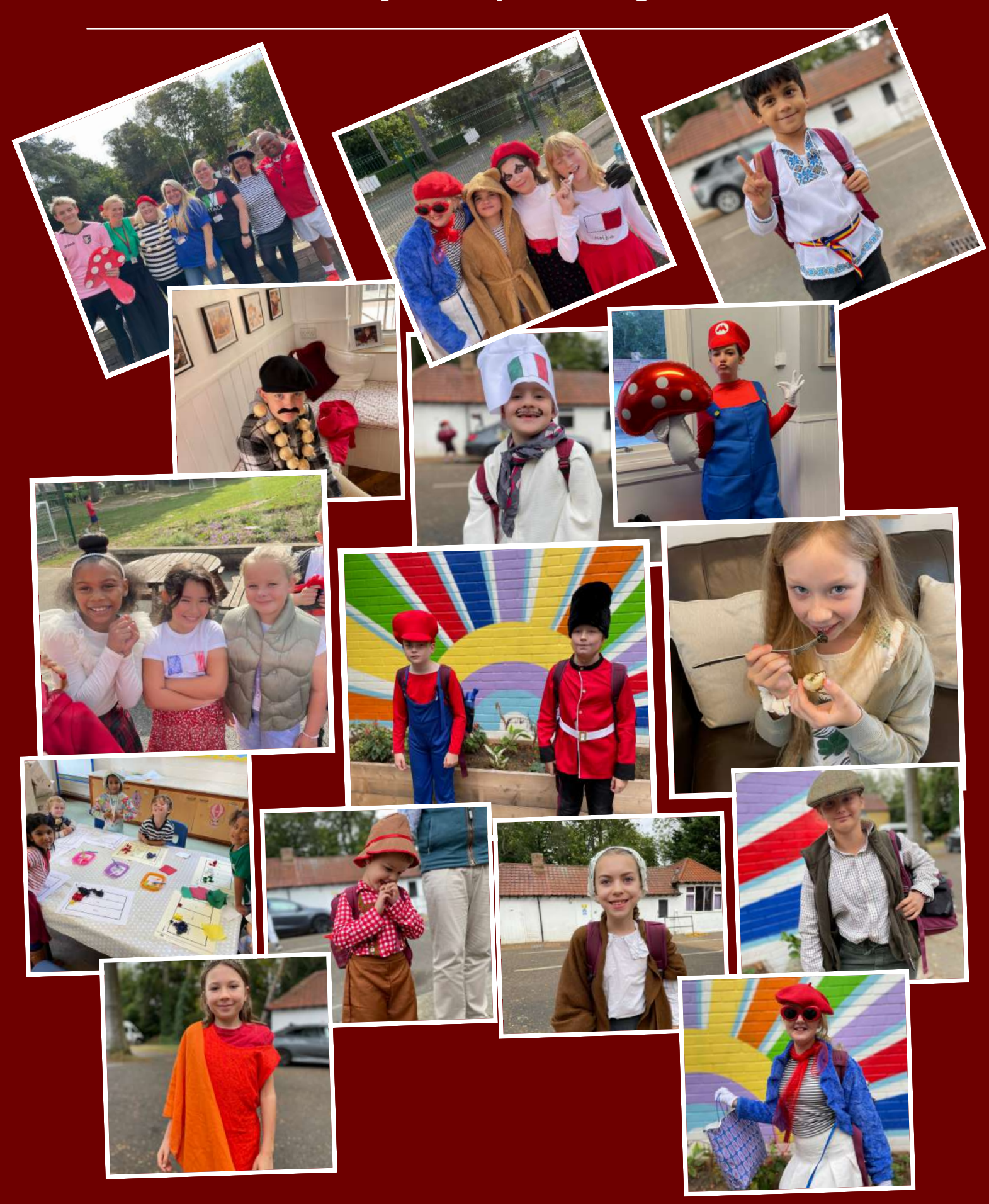
₩ We had a fantastic time celebrating European Languages Day last Tuesday! Our students rocked colorful outfits, embracing Europe's vibrant culture, and had a blast with fun activities. #EuropeanLanguagesDay #CulturalCelebration #SouthLeePrep