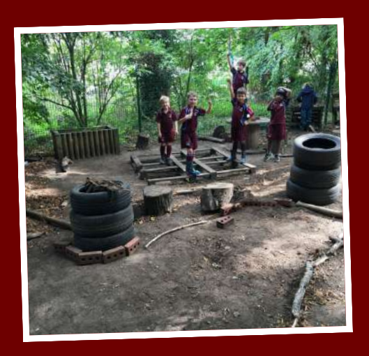
Year 3 boys were busy unleashing their creativity! To Some crafted a forest school pond, while others built an epic army bunker. The #NatureCrafts #CreativeKids #ExplorationTime